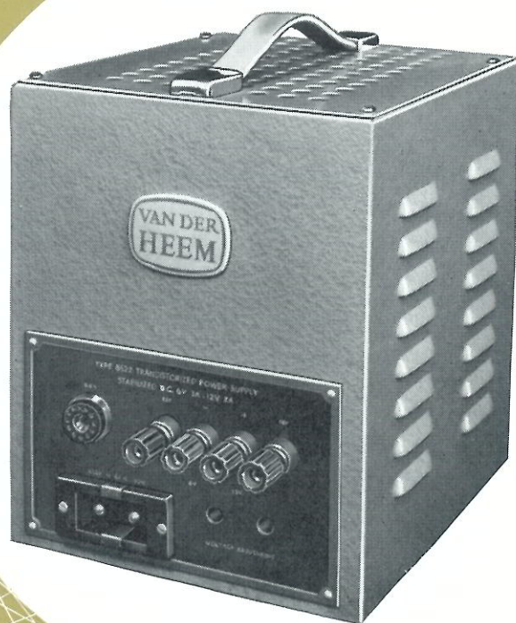
type 8622 K